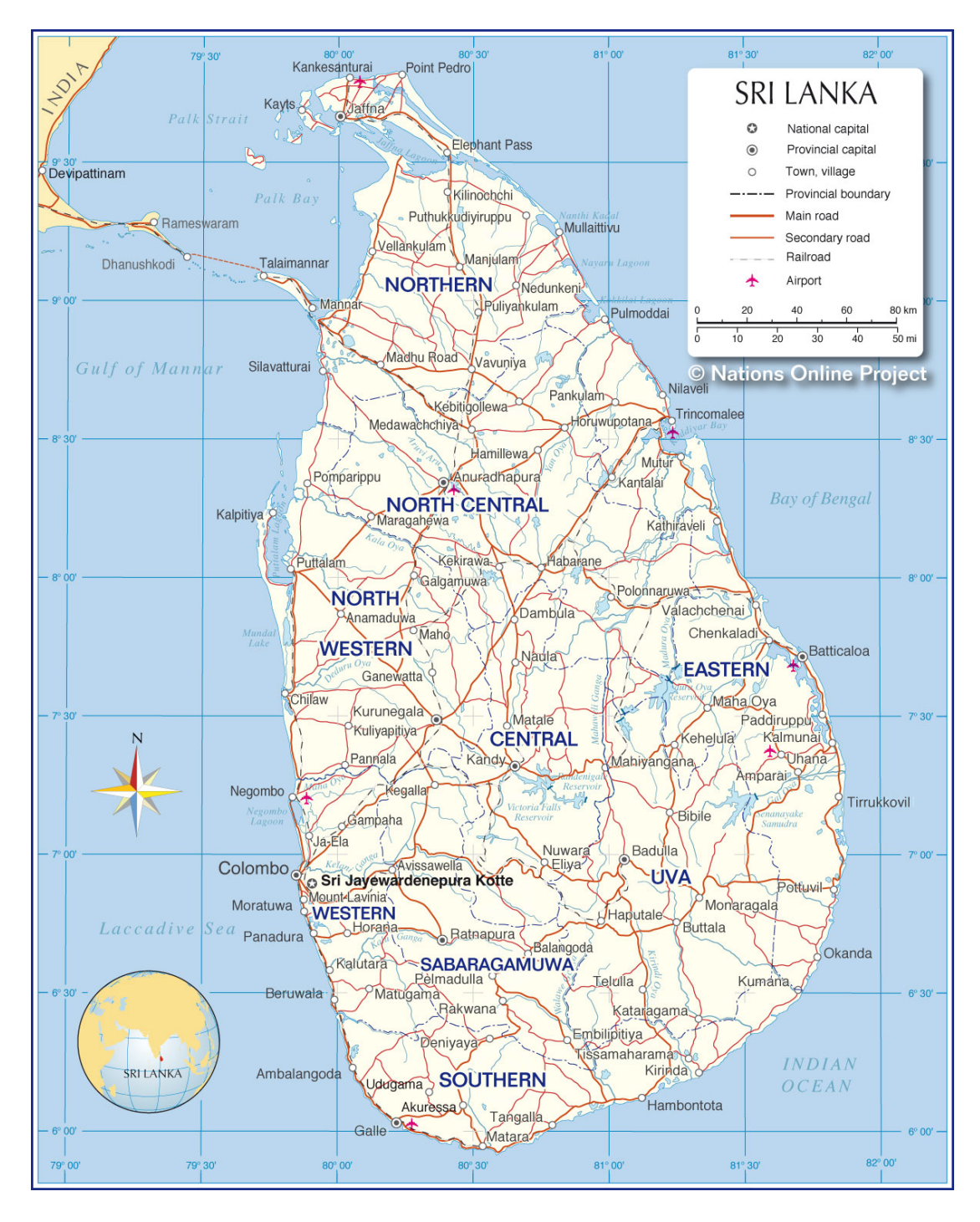
Figure 1. Administrative Map of Sri Lanka